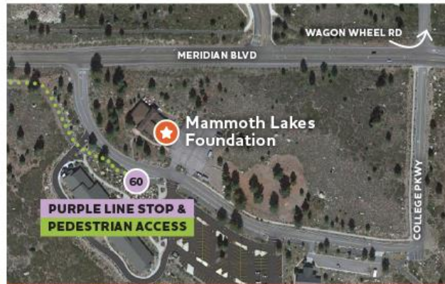
OPTUMSERVE™ TESTING – Mammoth Lakes

📍 Mammoth Lakes Foundation 100 College Parkway