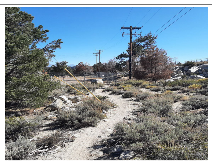
Looking east before SCE substation & FS sewer plant