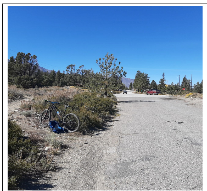
East of Crowley Lk Dr & Rock Ck Rd intersection (looking west)

Mono County Sustainable Outdoors and Recreation and Mono County, at the recommendation of its County Service Area 1 (CSA1) advisory board, wish to support and increase new non-motorized multi-use trails in South Mono County. One short-term goal is to legalize historic trails. The Toms Place to Lower Rock Creek informal or non- system trail has no trail head, signage, or facilities. This trail receives significant use and no maintenance. A second goal is to utilize existing public facilities (parks, campgrounds, parking areas) as access / exit nodes, and to build new trails to connect these facilities and access our local communities.