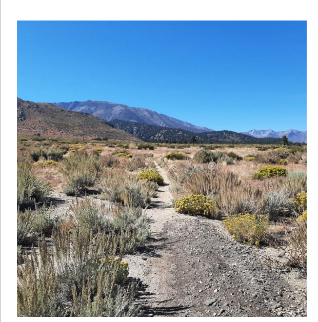
FS Rd 4S120L looking west – Birch Fire scar 2002 and old highway mixing table