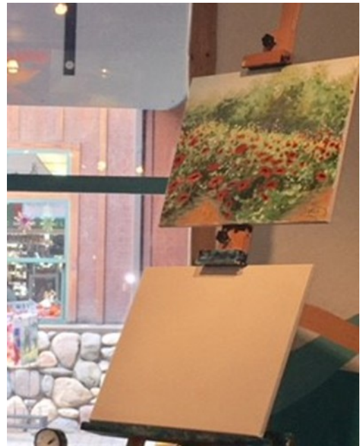
This was original painting we were copying from.