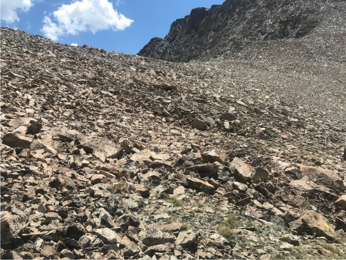
View standing on potential building looking up at ridge: