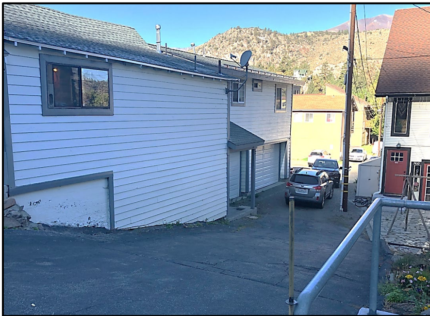
Figure 3 (above) – Subject property and neighboring properties. Proposed uncovered parking spaces lined in yellow.