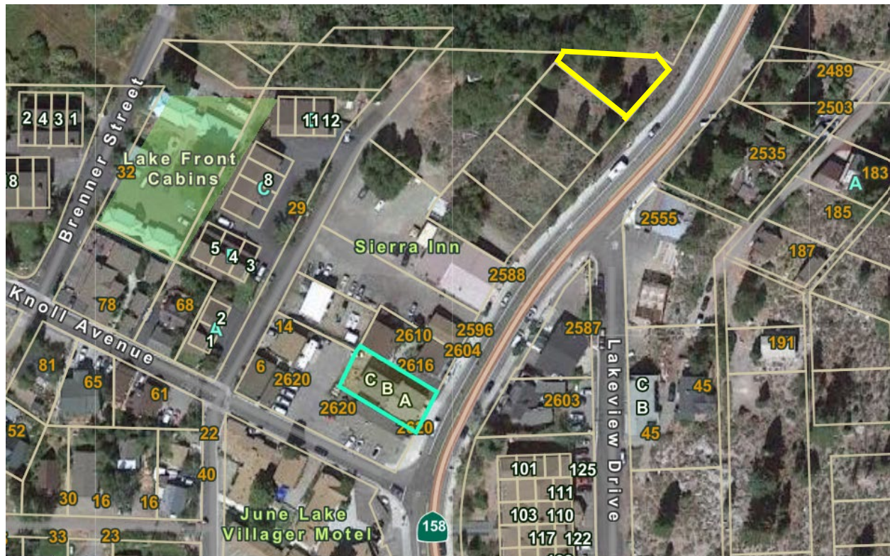
Figure 2 – Subject property outlined in green; proposed off-site snow storage parcel outlined in yellow.

The property has an existing, non-conforming snow storage area and the proposed use would further reduce the snow storage area because the two outdoor parking spots are currently being used for snow storage.