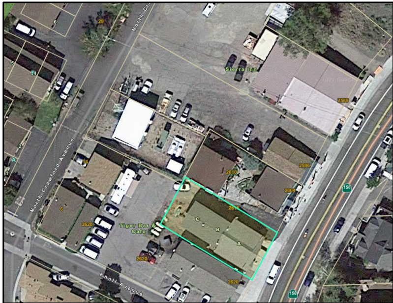
Figure 1 – Subject property outlined in green.

The proposal is for a parking reduction plan on a 0.11-acre parcel located in the June Lake Central Business District at 2616 State Route (SR) 158, (APN 015-075-005-000), and for off-site snow storage on a nearby parcel (APN 015-075-117-000). Both parcels are designated Commercial (C). The surrounding parcels are all designated Commercial. On the applicant's property, the portion of the building fronting SR 158 contains the retail business, Sierra Wave. Two long-term rental residences are located in the rear portion of the building and are situated adjacent to the neighboring L-shaped parcel which contains a bar & cafe, accessory buildings and a parking lot (see Figure 1).