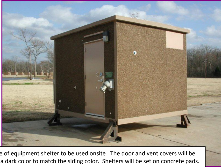
Sample of equipment shelter to be used onsite. The door and vent covers will be painted a dark color to match the siding color. Shelters will be set on concrete pads.