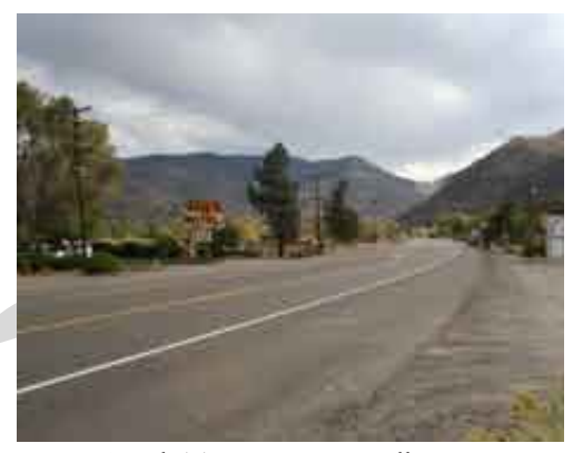
US 395 with Turn-Lane in Walker

Cell service is limited in the area, but improving. Additionally, locals have noted there is no broadband access.