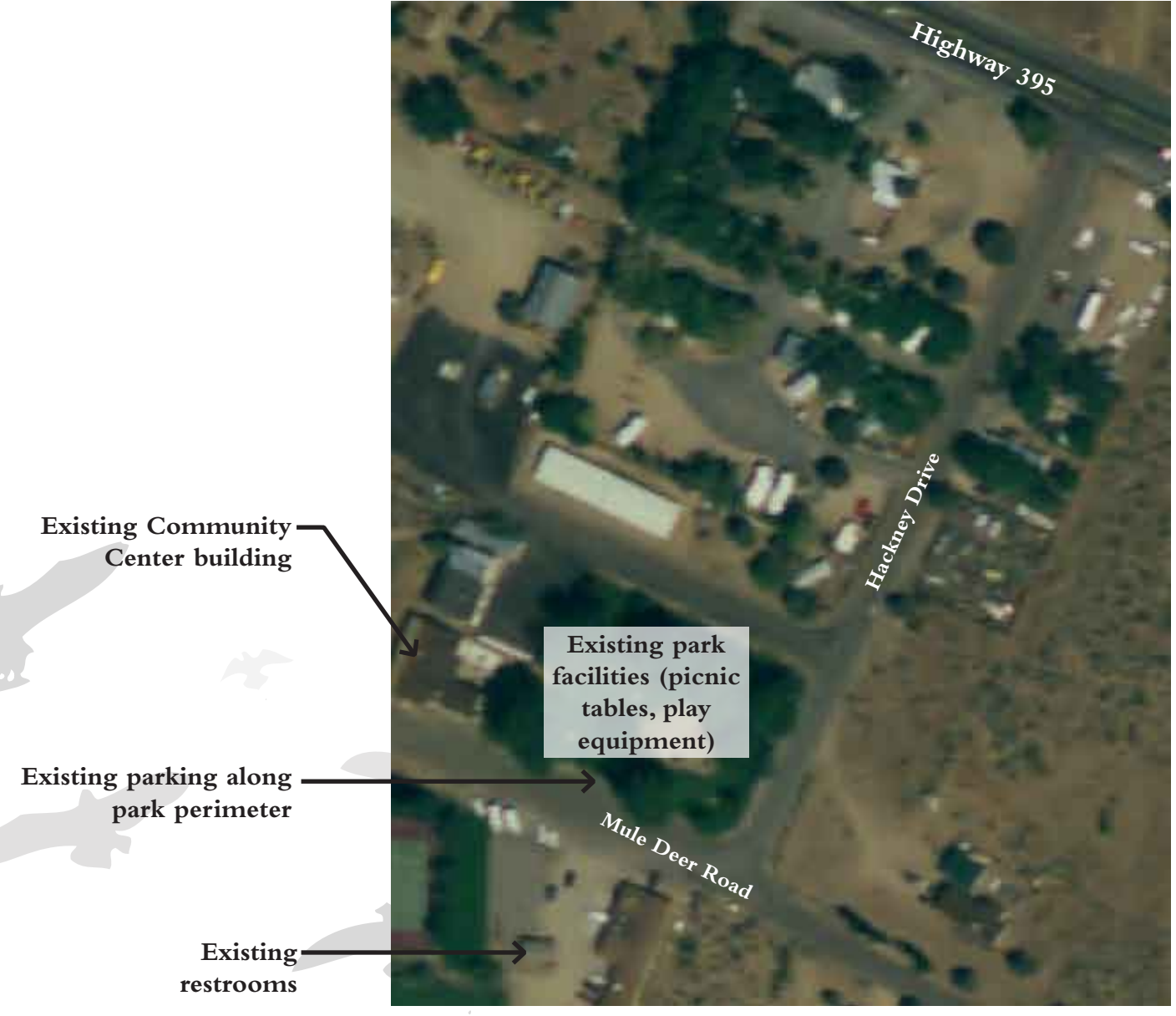
Walker Community Center/Park Area Before Enhancements

Minimal aesthetic enhancements are needed along this section of the highway. Rather, future projects should focus on not damaging the integrity of the existing landscape and viewsheds. The Corridor's existing heritage trees should be preserved, such as the cottonwoods north of Walker. Where highway widening is needed to allow for expanded shoulders for pedestrian and cyclist use, trees may need to be removed. In this situation, replacement trees should be provided.