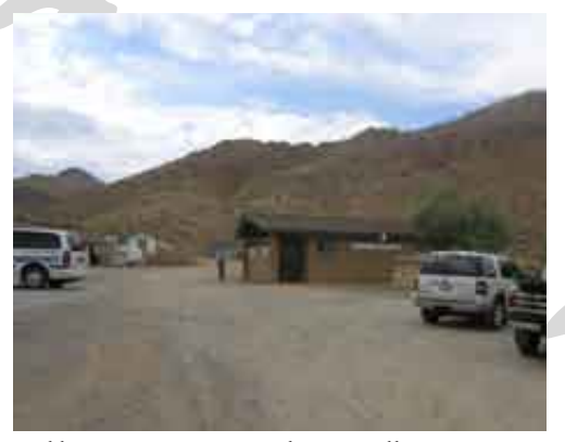
Public Restrooms at Park in Walker