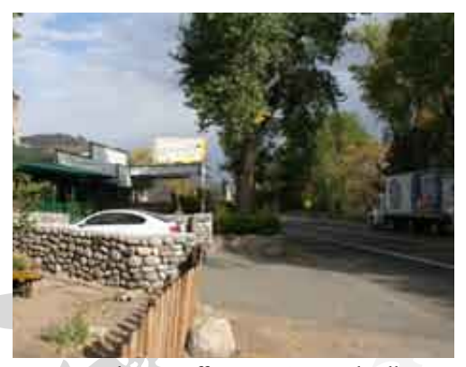
Commercial Use Off US 395 in Coleville