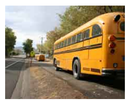
School Adjacent US 395 in Coleville