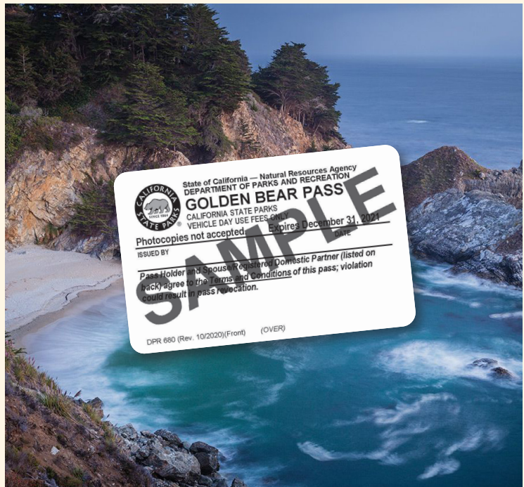
Photo: California State Parks/Julia Pfeiffer Burns State Park. Big Su

The pass provides FREE day-use entry at 200+ state parks and beaches. The passes are valid from January 1, 2022 to December 31, 2022.